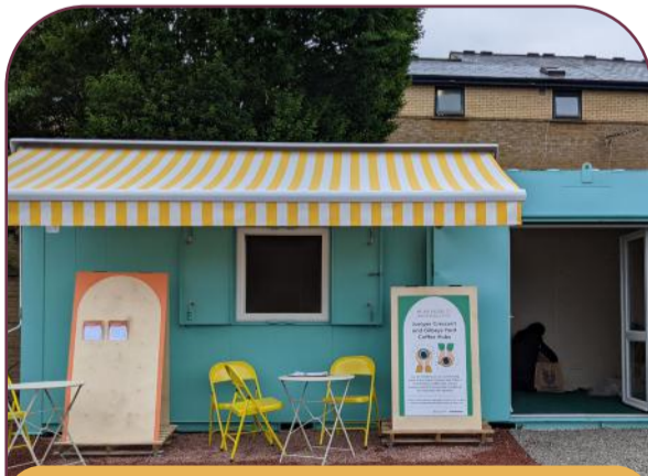
THE RESIDENT HUB

SPECIALISTS TO TALK TO YOU ABOUT KEEPING YOUR NEW HOME AFFORDABLE FOR YOU!