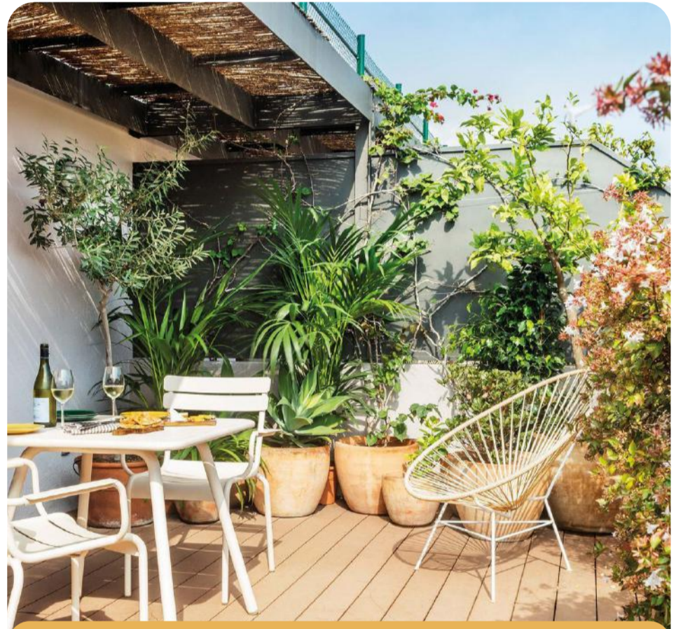
NEW - LARGER PRIVATE SPACES