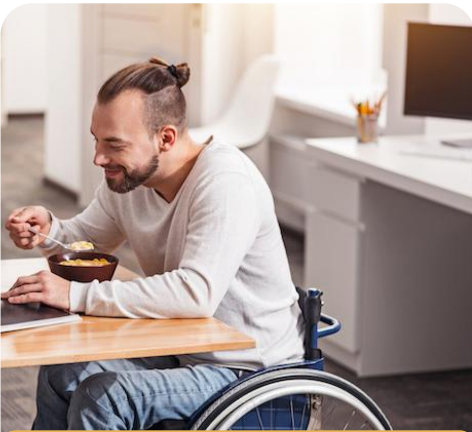
FULLY ACCESSIBLE HOMES

WE WANT TO WORK WITH RESIDENTS TO PROGRESS THEIR IDEAS FOR NEW HOMES NOW, SO THAT BY THE SUMMER WE CAN UNVEIL A PLAN FOR REGENERATION THAT RESIDENTS HAVE CONTRIBUTED TO AND FEEL PART OF