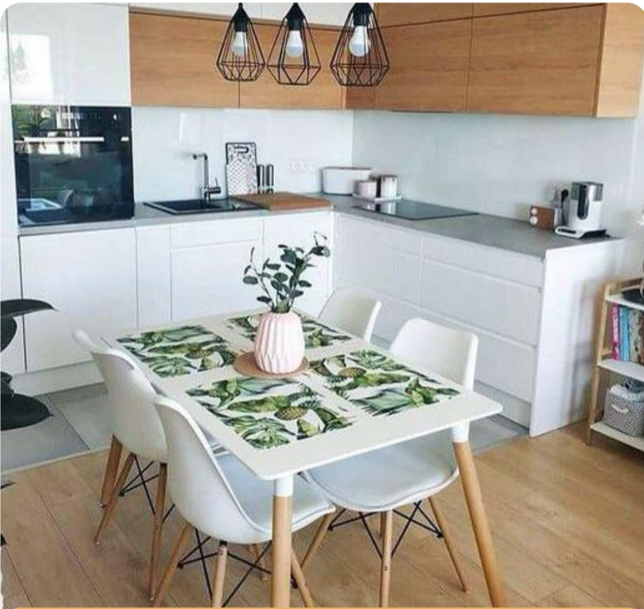
NEW - FLEXIBLE HOME LAYOUTS

This has been done by looking at all the things you have told us!